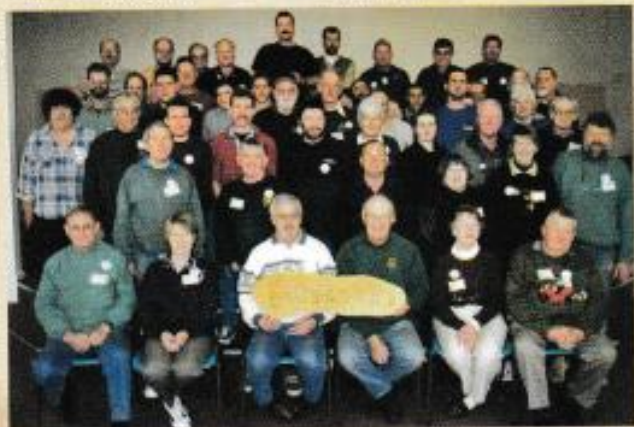
Participants in SATurn 1999.