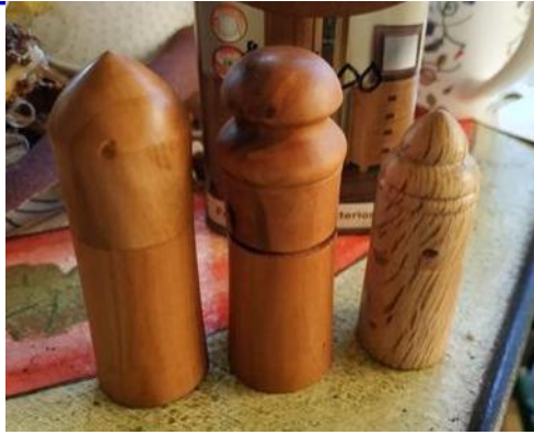
Three pill pots – practice pieces