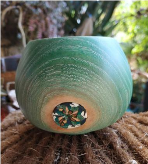
Green limed ash pot with Fimo insert