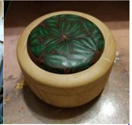
Ash box with Fimo insert