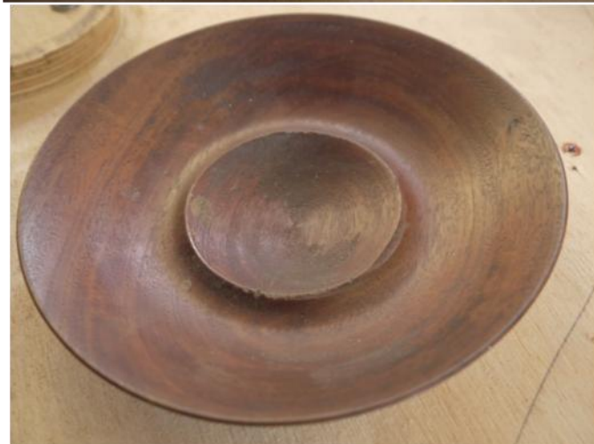
Top left—my favourite piece Left—my first piece Top right—my shed