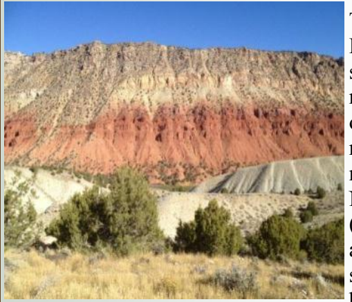
Flaming Gorge, Eastern Utah

There were 2 things I really wanted to do. One was to visit the Rocky Mountain Woodturning Symposium and the other to see Mesa Verde National Park. Unfortunately, 12 inches of rain in Boulder County north of Denver on the "front range" of the Rockies caused billions of dollars damage to homes and roads, so the Symposium had to be cancelled at the last minute. We made use of those 4 days to drive to Yellowstone National Park, where the Yellowstone Canyon was awesome (to use one of Jake's terms) and the hot springs interesting and amazing. Even there, we had bad weather – thunderstorms, sleet, hail, and even a bit of snow. We did see some elk and buffalo, but in small numbers. Didn't meet any bears luckily. We returned via the Flaming Gorge with richly coloured cliffs overlooking a reservoir. As in Australia, there are long distances to be travelled, and we did 1600 miles in 4 days!