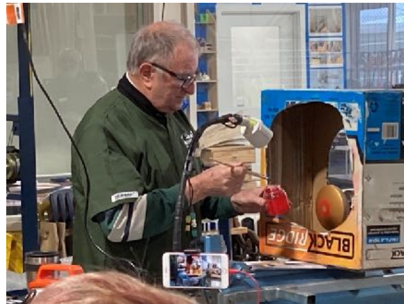
Applying red paint to a bowl