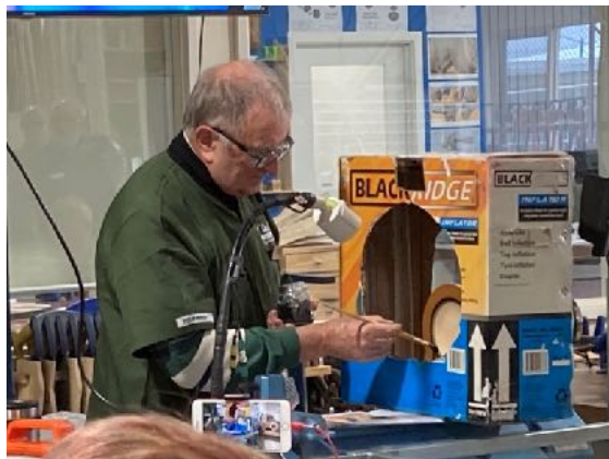
Applying black paint to a rim