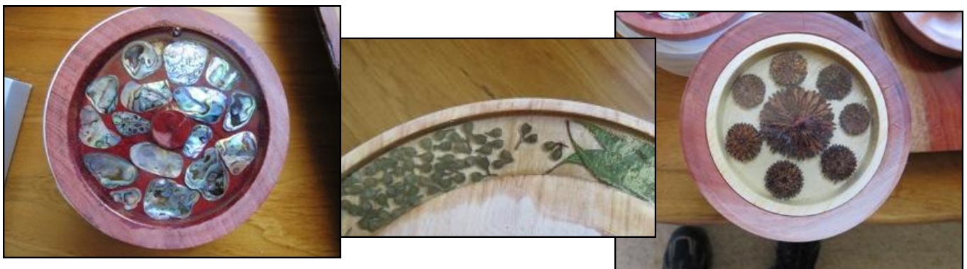
Examples of work in process—before turning, sanding & polishing

As it takes approx 24 hours to skin the poured articles were left in the storage to be picked up the following week.