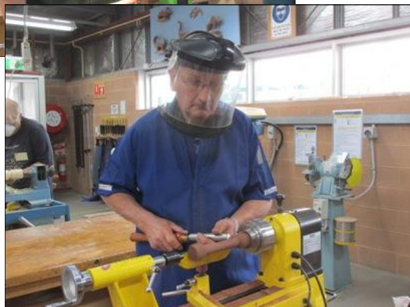
Some of our members making needle cases