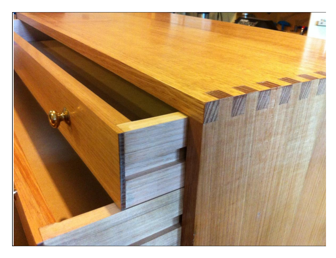
Detail of the joints used for the carcass of the drawers