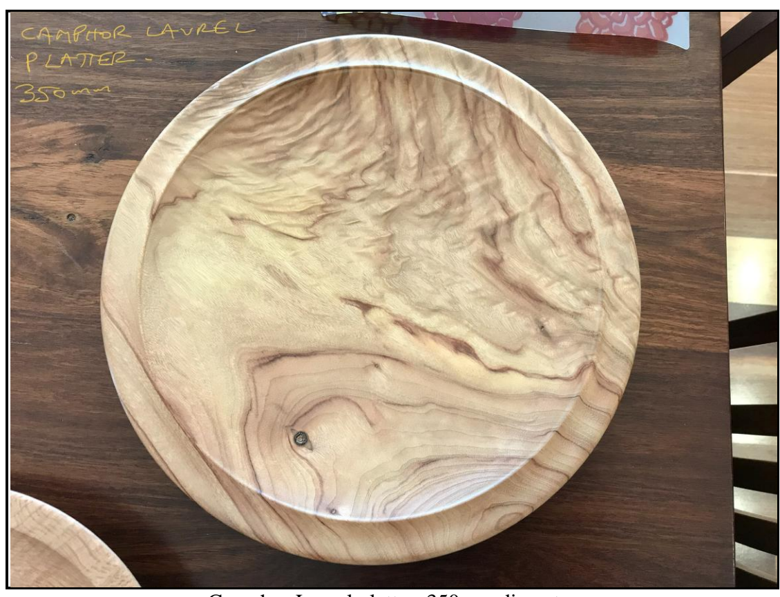
Camphor Laurel platter, 350mm diameter