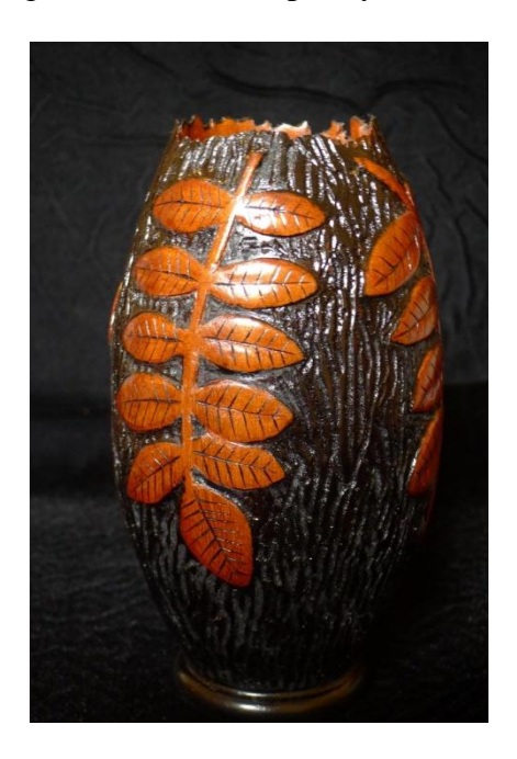
Carved Red Cedar Hollow Form

Our Esteemed Secretary sent me these photos of his recent work. As usual, some interesting finishing and excellent carpentry.