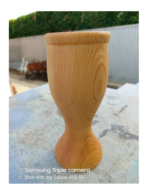
The completed vase from the Oregon