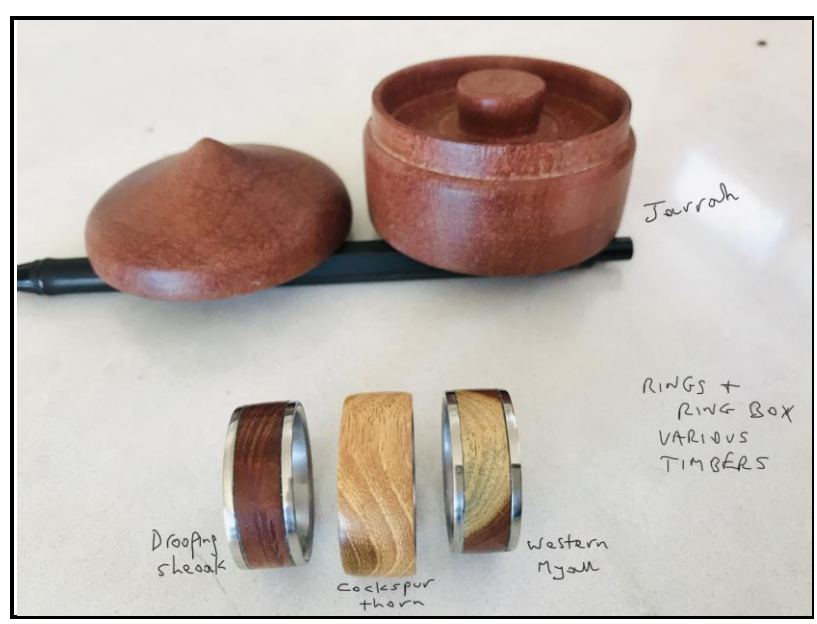
Rings and ring-boxes as labeled