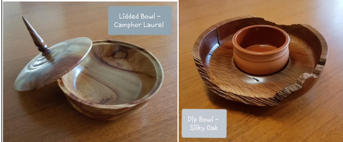
A lidded bowl of camphor laurel