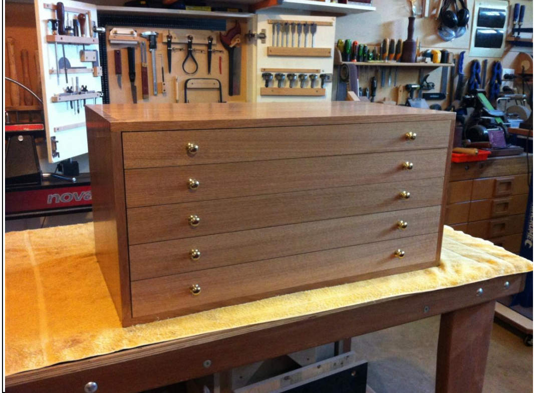
Two views of the finished piece - a beautiful product salvaged from discarded drawers.