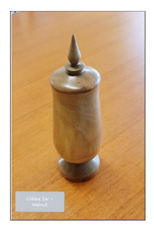
Lidded jar in walnut