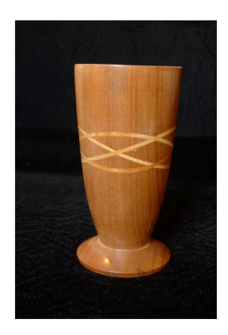
Celtic Knot Vase in Blackwood