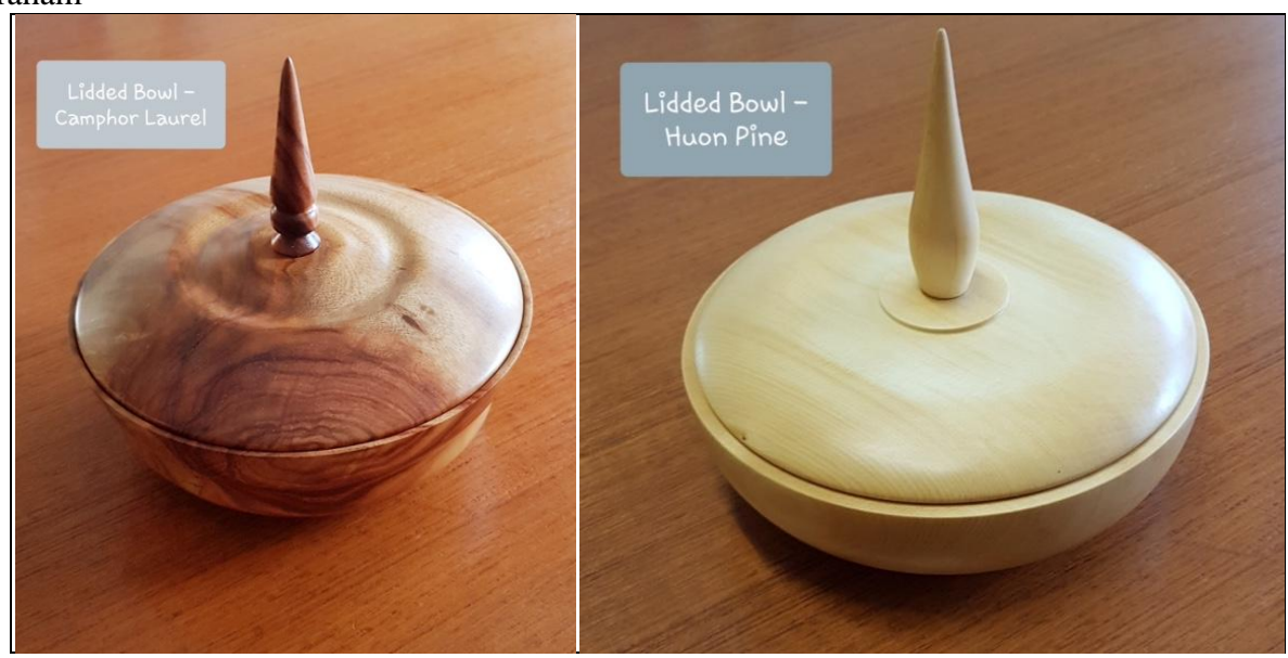
Lidded bowl – camphor laurel