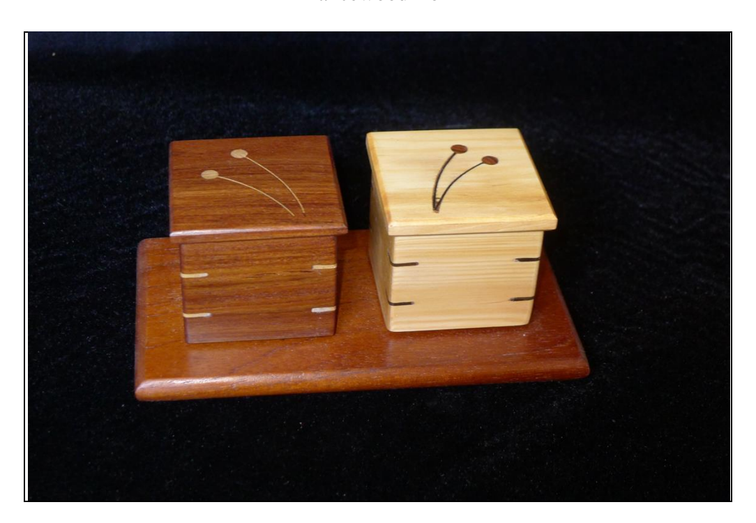
Ring Boxes:- Lancewood and Huon Pine