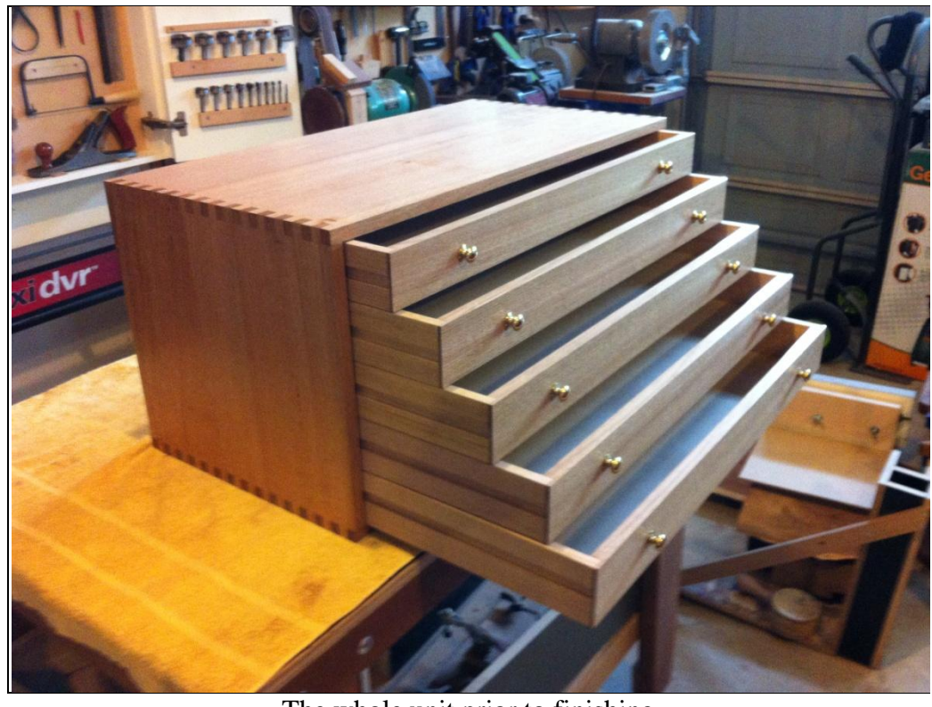
The whole unit prior to finishing