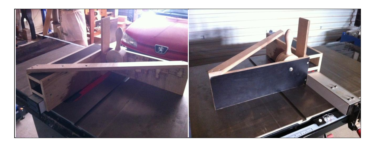
The tenoning jig to cut the joinery for the drawers.

Well, I'll sign off now. Do keep safe and we'll talk some more another day. Cheers Guido