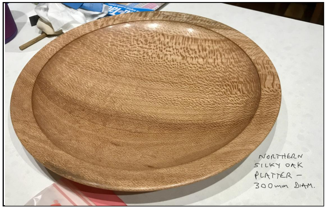
Northern Silky Oak platter, 300mm diameter