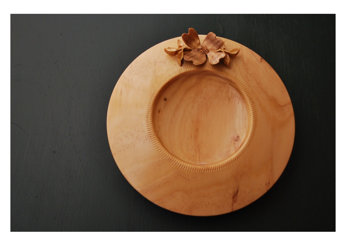
Display bowl with dog rose cut with scroll saw