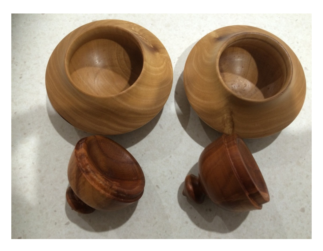
Internal view of the two boxes, finished with wax.