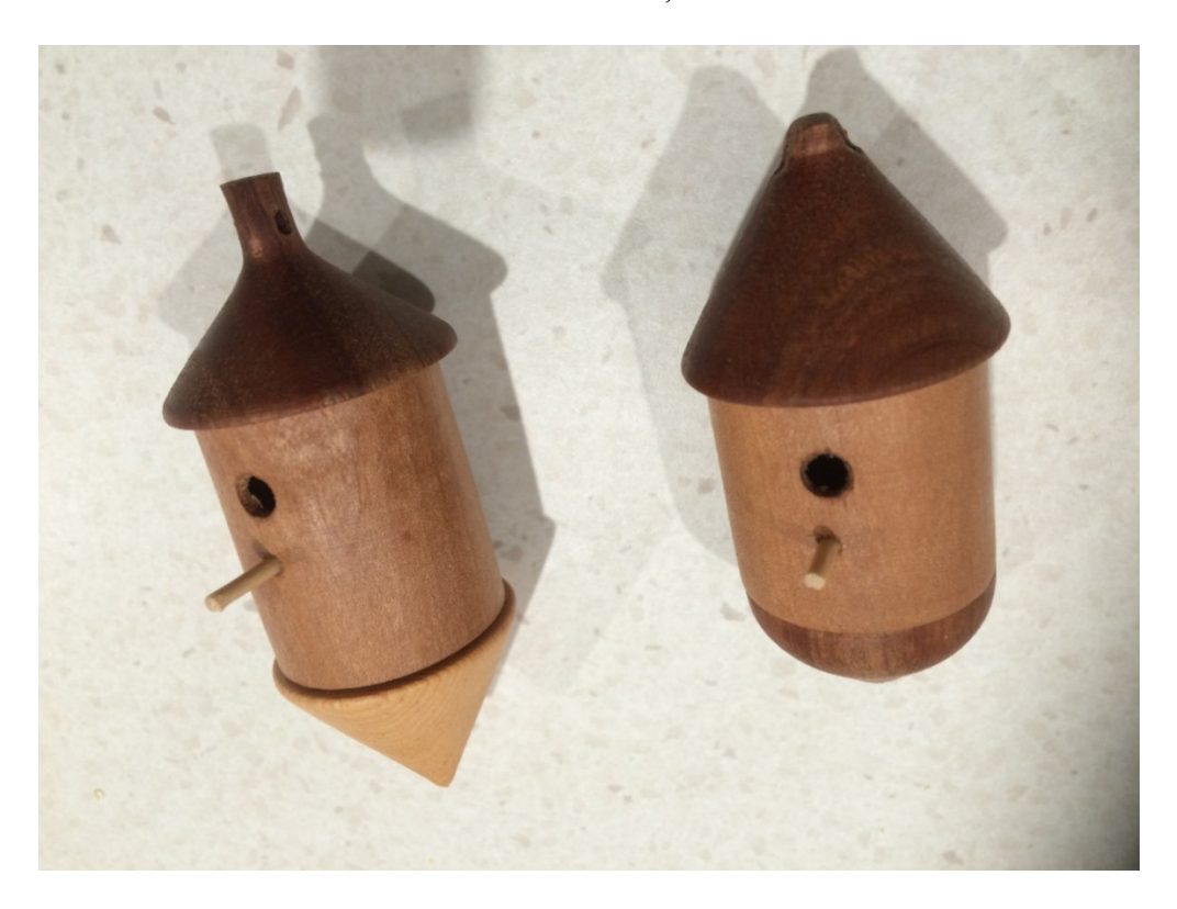
A couple of little bird boxes which I finished at the same time.