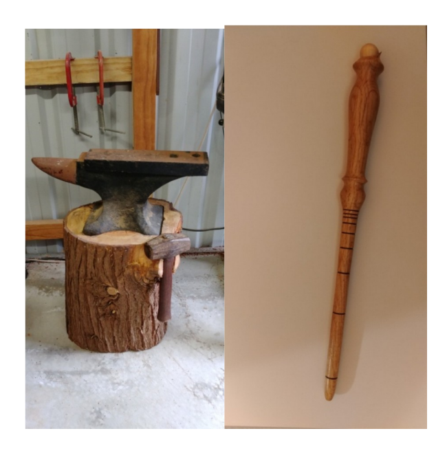
The cypress log and anvil